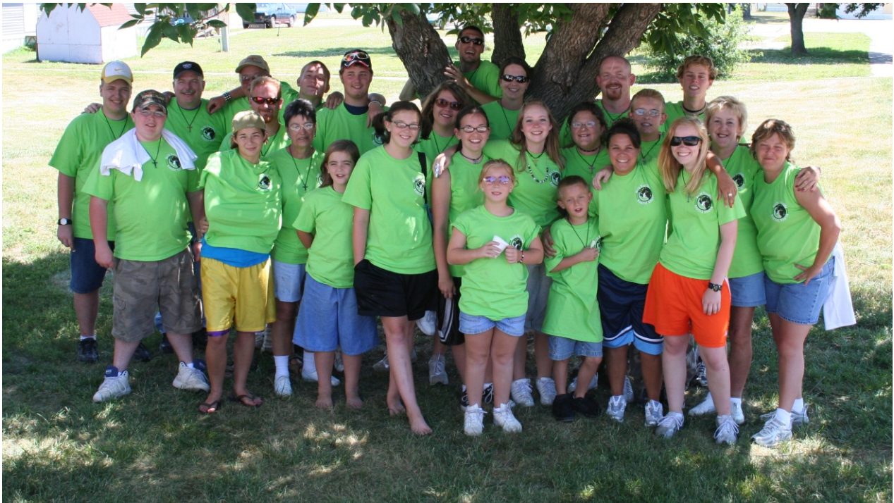
These youth, along with their chaperones, from North Knoxville Baptist Church recently performed a service project in Nebraska as part of a summer mission trip.

Knoxville News-Sentinel Aug. 22, 2007, p. 19 (NS3)